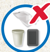
Single Use, Disposable Packaging eg. Polystyrene

Why waste it? When you can avoid or reduce it.