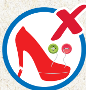
Low Quality Non-Durable Items