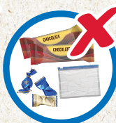
Individually Packaged/Wrapped Food Items