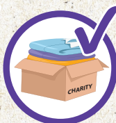
Pre-Loved Clothing, Towels and Bedding