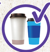
Non-Disposable Coffee Cups