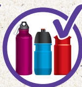
Non-Disposable Water Bottles