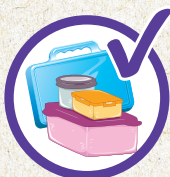
Non-Disposable Lunch Boxes and Food Packaging